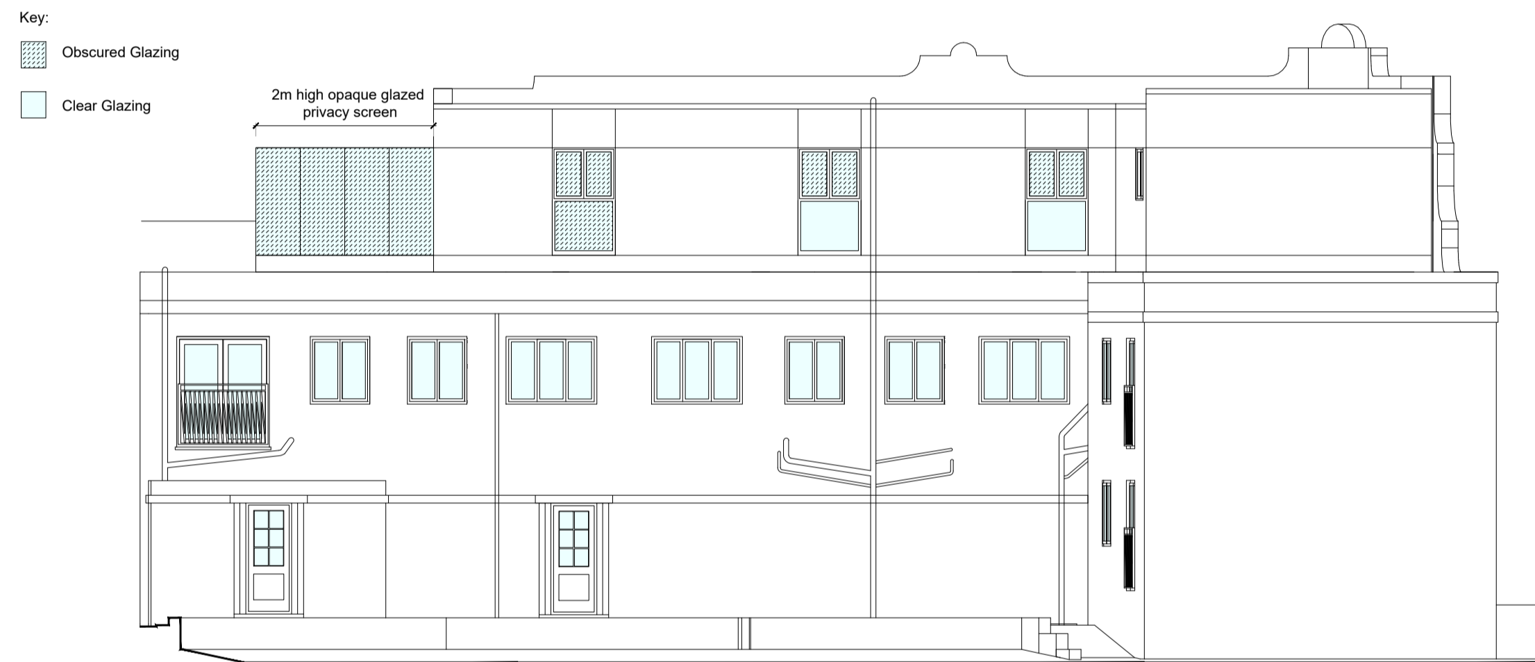
Proposed North Facing Elevation 1:100