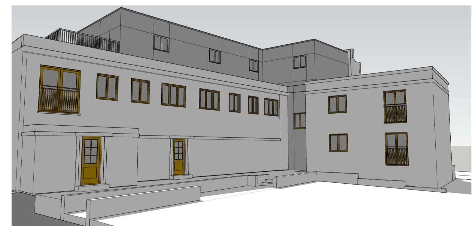
Parking area (North) Elevation