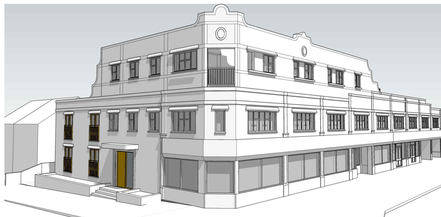
Grasmead Avenue & London Road (West & South) Elevations