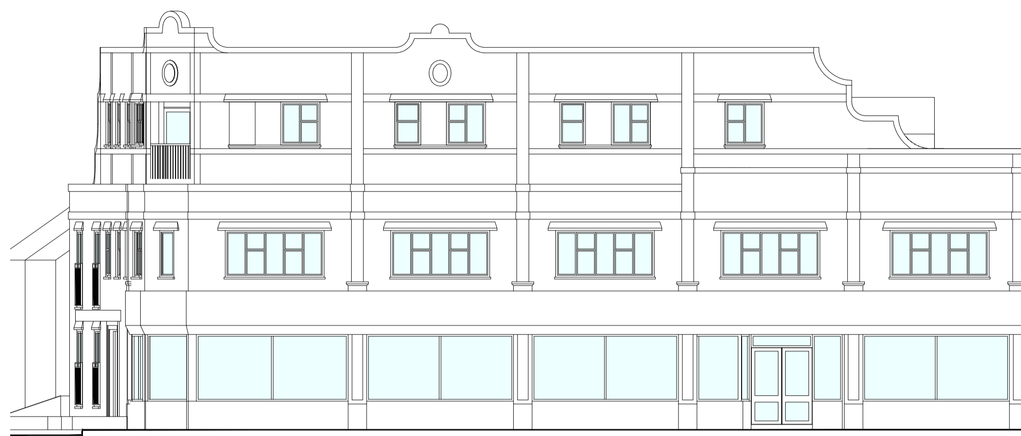
Proposed South Facing Elevation 1:100