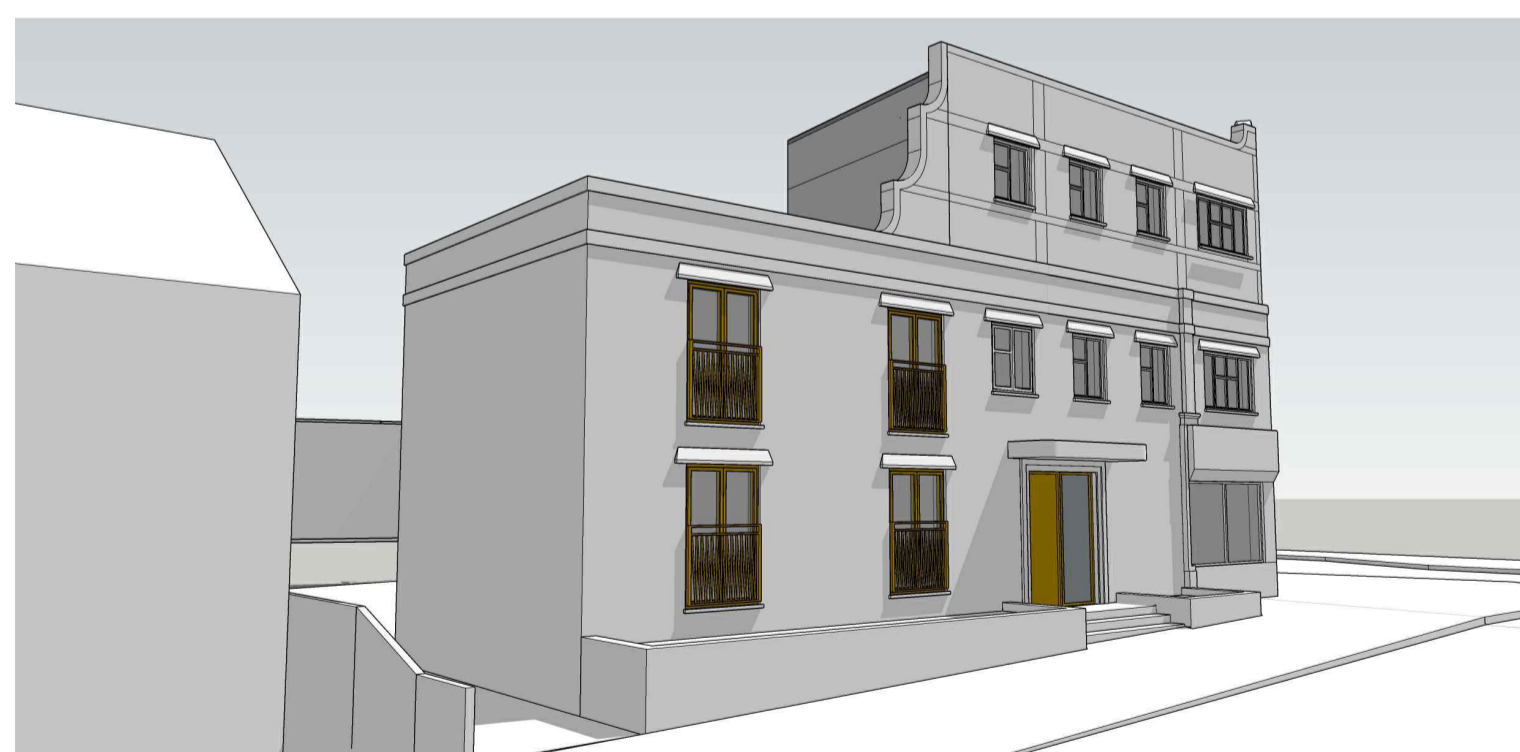
Grasmead Avenue (West) Elevation