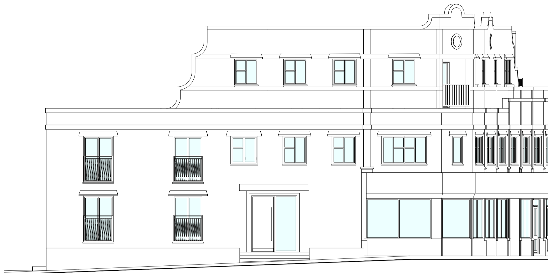
Proposed West Facing Elevation 1:100