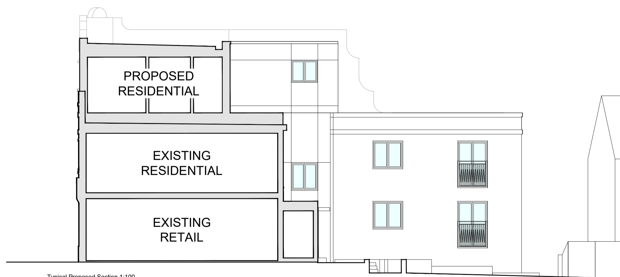
Typical Proposed Section 1:100