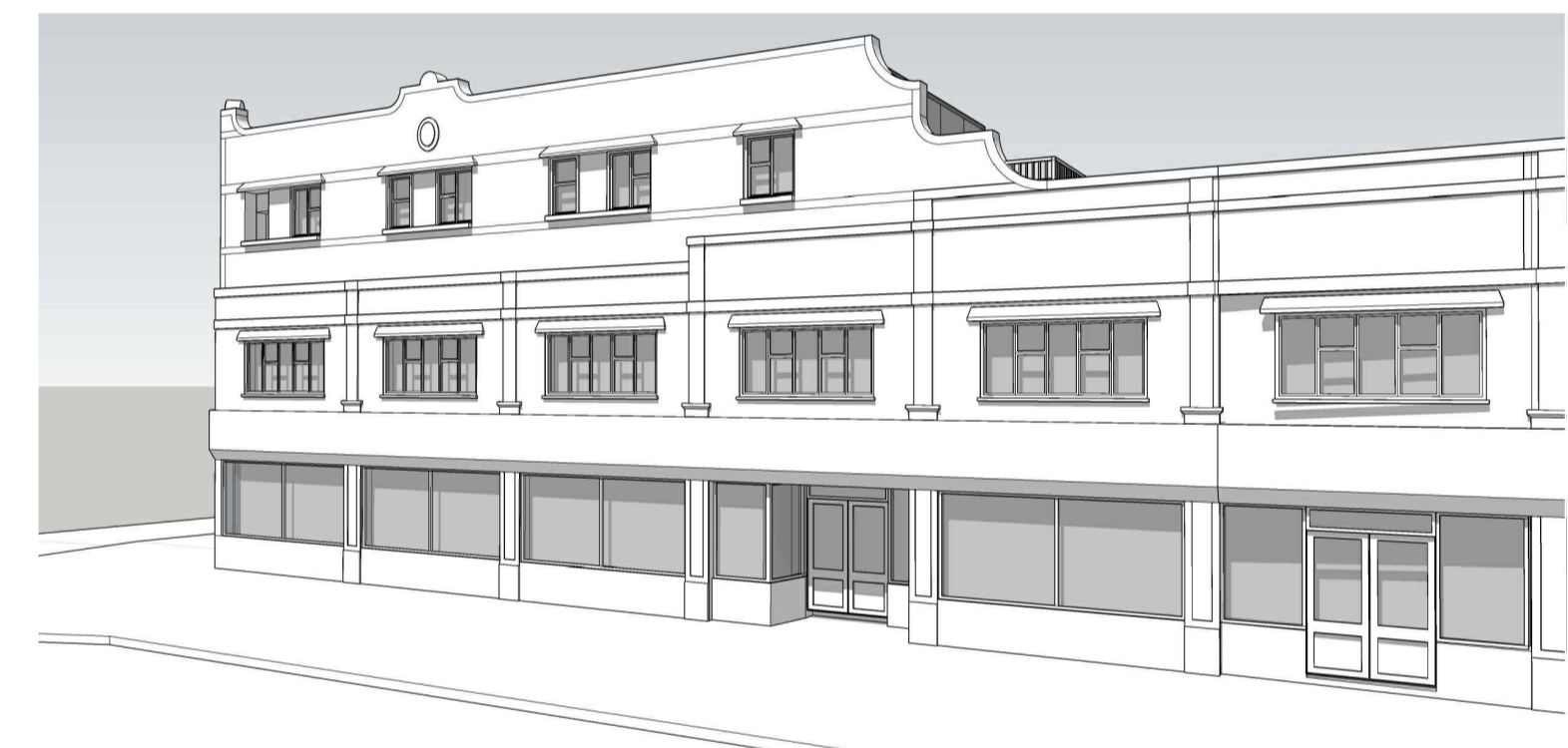
London Road (South) Elevation